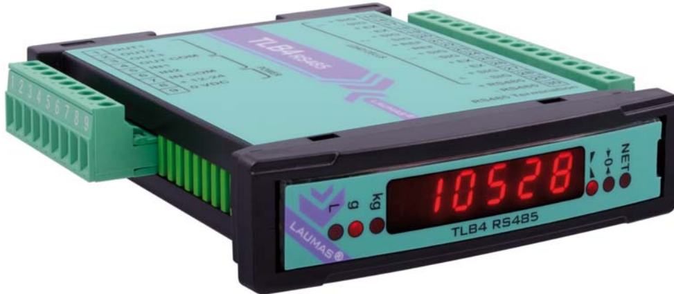
Front panel mounting (fixing kit included)